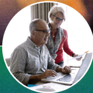
Retired AFSCME Members