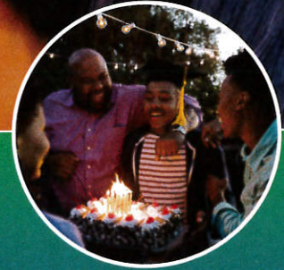
Family of AFSCME Members*

*Family of AFSCME members are defined as parents, siblings, children (or stepchildren), grandchildren (or step-grandchildren), spouses, domestic partners, and financial dependents.